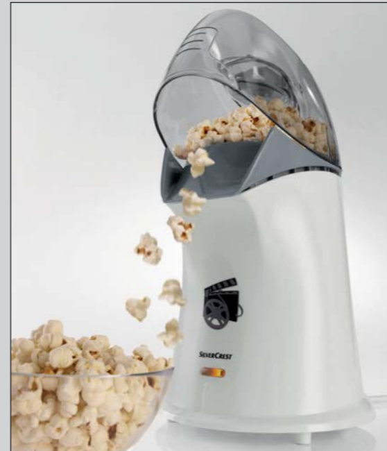
GB Popcorn-Maker IE Operating instructions

KOMPERNASS GMBH BURGSTRASSE 21 · D-44867 BOCHUM www.kompernass.com ID-Nr.: SPCM1200A1-09/10-V1 IAN: 62050