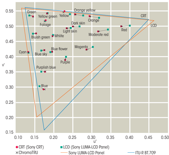
CIE Color Coordinates

A second calibration is further applied so that white balance is maintained at a consistent color temperature throughout all grayscale levels. The result of these precise calibrations is excellent color reproduction reminiscent of Sony's CRT displays.