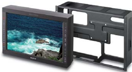
The LMD-1751W with an optional MB-530 Mounting Bracket

The LMD-1751W (7U high) can be rack mounted using an optional MB-530 Mounting Bracket. Complying with VESA standards, LMD-1751W monitors can be easily mounted on walls and ceilings.