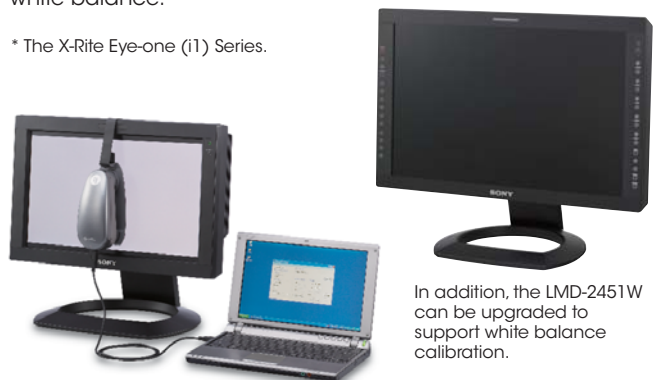
The LMD-1751W with a PC and X-Rite Eye-one(i1).

In addition, the LMD-2451W can be upgraded to support white balance calibration.