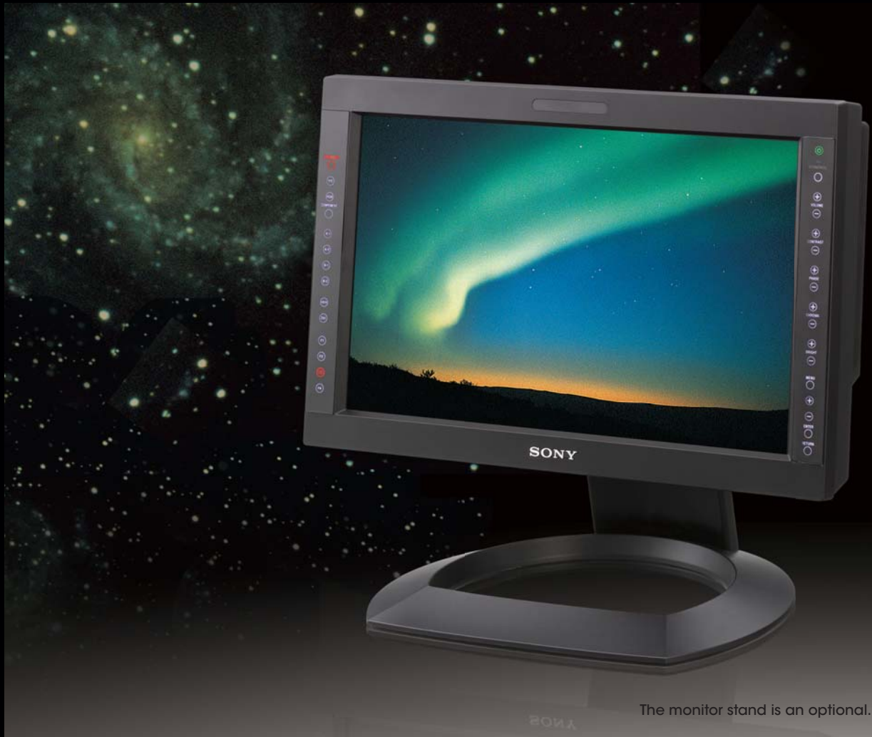
The monitor stand is an optional.