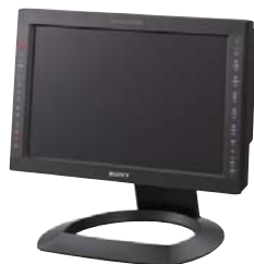
The LMD-1751W with an optional stand, SU-561.