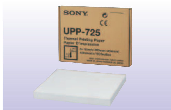
UPP-725 Thermal Paper Printing Pack