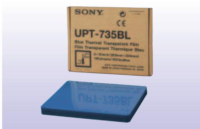
UPT-735BL Blue Thermal Film Printing Pack