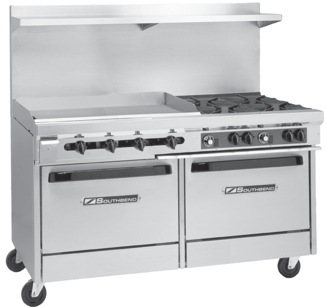
(shown with optional casters)