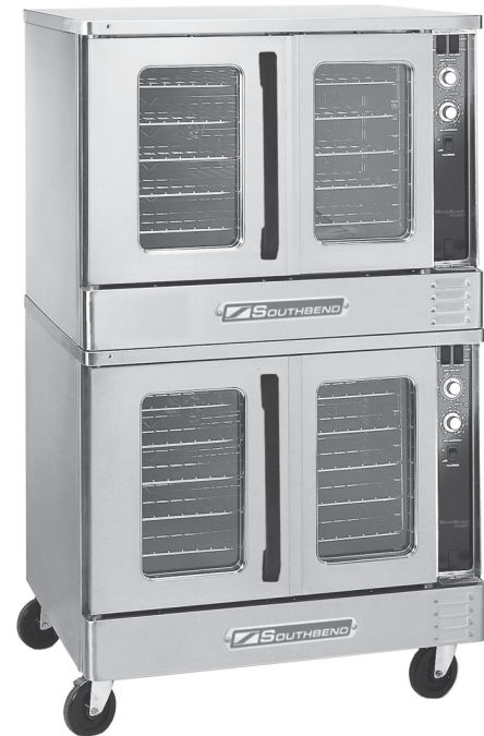
(shown with optional casters)

150°F to 500°F temperature controller with 140°F to 200°F "Hold" thermostat Dual digital display shows time and temperature. A fan cycle timer pulses the fan.