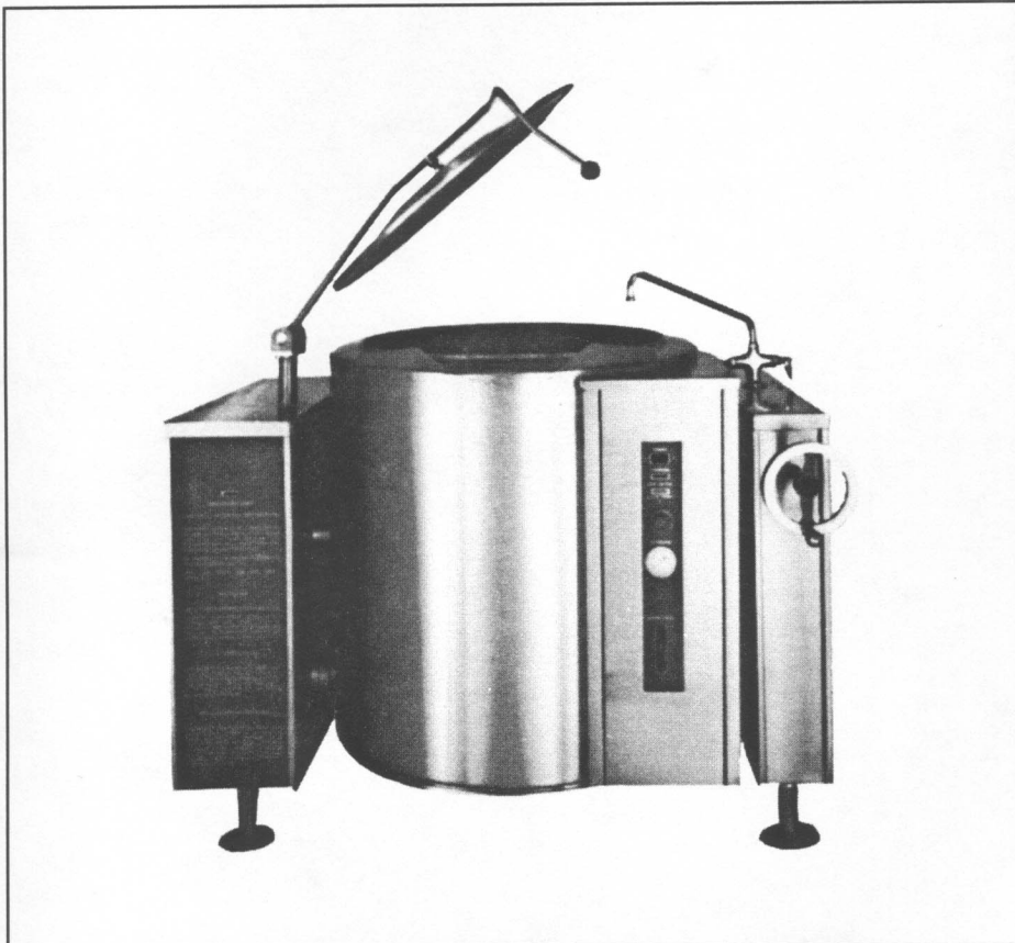
Model KTLG-60 with Optional Spring Assist Cover and Faucet

MODELS: 20 Gallon 30 Gallon 40 Gallon 60 Gallon KTLG-20 KTLG-30 KTLG-40 KTLG-60