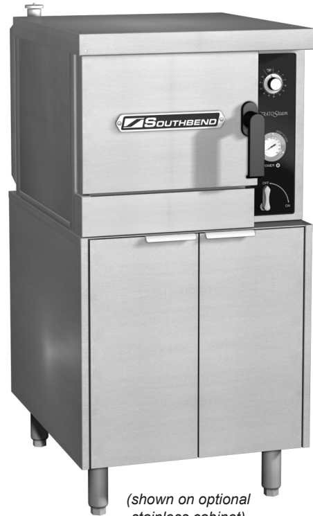
(shown on optional stainless cabinet)