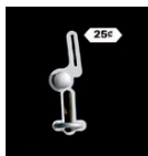
Electronic Coin Drop

Speed Queen offers many activation options to meet your specific market needs.