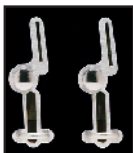
Dual Digital Coin Drop

Speed Queen offers many activation options to meet your specific market needs.