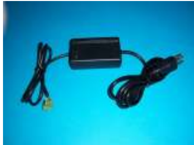
FIGURE 2: PSACV1 Power Supply