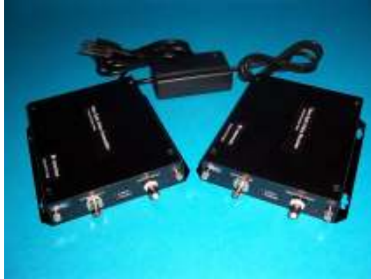
FIGURE 1: FVT1003 and FVR1003

The VersiVision FVT1000 transmitter and FVR1000 receiver modems are available as standalone devices for easy plug and play installation. In addition, the FVR1000 receiver modems can be ordered as circuit card modules (See Chart Above) for installation in the Model FVC14 rack-mount chassis. The 14-slot chassis fits in a standard 19" rack and is offered with either 110VAC or 220VAC power supplies. The dimensions of the FVT1000 and FVR1000 standalone devices are 7.5in (L) x 6.3in (W) x 1.2in (H).