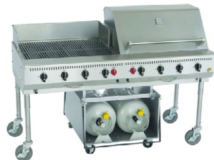
Model OCB60TH with Optional Wind Guard