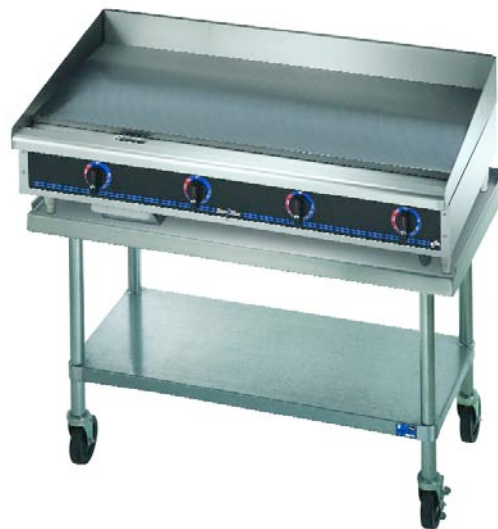
Model 648TSPD with Optional Equipment Stand and Casters