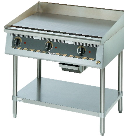
Model 736T Shown with Optional Floor Stand