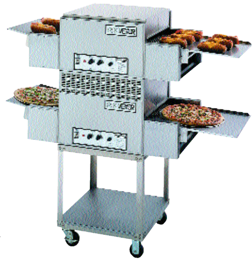
Model 314HX Stacked

Proveyor ovens are covered by Holman's one year parts and labor warranty.