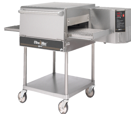
UM1854 (Single) with Optional Stand