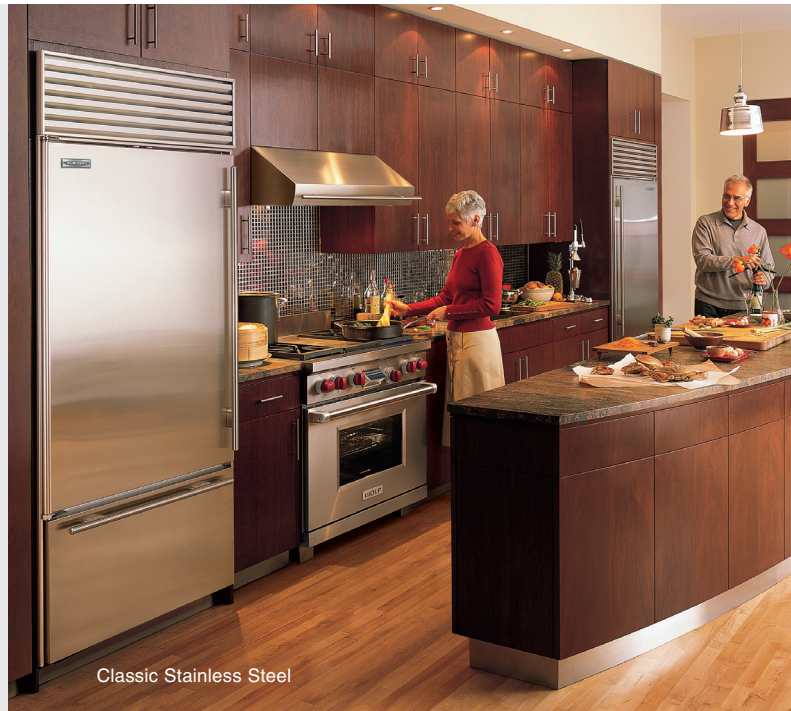
Classic Stainless Steel

One of our most popular units, the Model 650 offers large refrigerated storage, plus the convenience of a handy freezer drawer with an automatic ice maker. The Sub-Zero dual refrigeration system assures superior food preservation and no odor transfer. Model 650 is available in the framed, overlay and stainless steel design applications and in three stainless steel finishes.