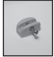
Rear Foot (2) (With Nut & Bolt)