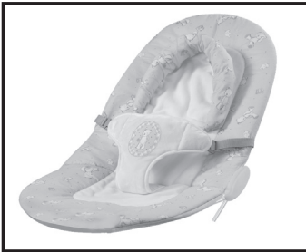
Seat Cover Assembly (with Restraining Belt)