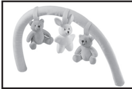
Toy Bar / Toys