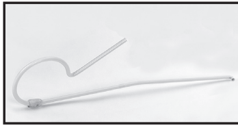
Leg (1 left & 1 right)