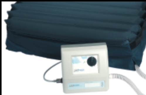
Jay Dermafloat™ LAL 1100