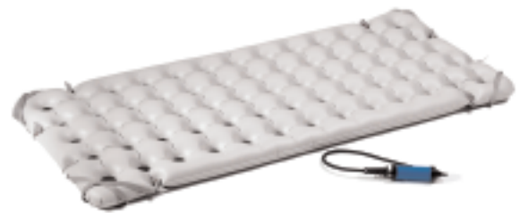
SAM 35 PAD two-way hand pump sold separately