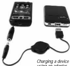
Charging a device using an adapter.

NOTE: If none of the included adapters fits snugly into your portable device power jack, please go to our web site at www.tekkeon.com/tcadapters to determine which adapter plug you need for your device. You can obtain most adapters through the web site, or by contacting Tekkeon by phone at 1-888-787-5888 or 1-714-832-1266 . If available through Tekkeon, the adapter will be sent to you for a nominal fee.