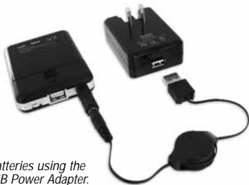
Charging batteries using the Tekkeon USB Power Adapter.