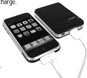
Charging a device using its USB cable.