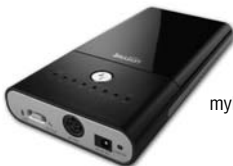
myPower ALL lithium polymer rechargeable battery