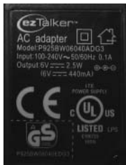
Sample Power Adapter Label

(If available, use the voltage specification shown on the power adapter.)