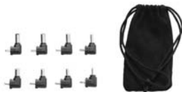
Adapter plug kit with drawstring bag (8 adapter tips)