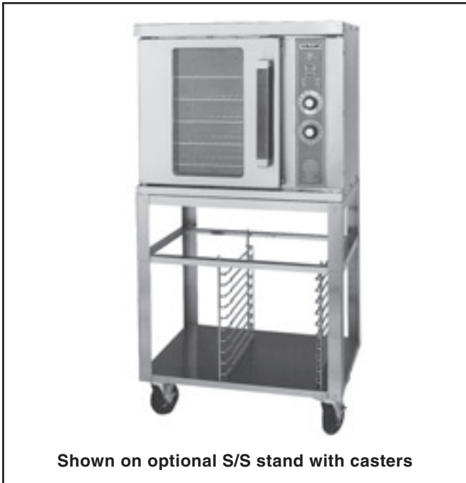
Shown on optional S/S stand with casters