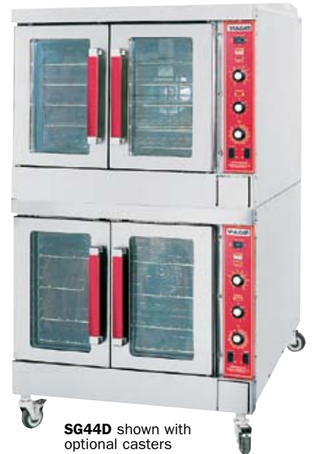
SG44D shown with optional casters

Vulcan's exclusive design recirculates heat in a gentle airflow that helps keep baked goods light and delicious—and helps control energy costs by recycling heat. The Vulcan air distribution system also enhances operator comfort; hot air isn't forced out when the doors are opened.