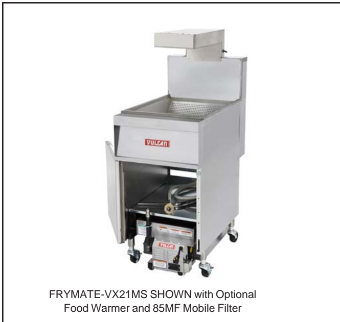
FRYMATE-VX21MS SHOWN with Optional Food Warmer and 85MF Mobile Filter