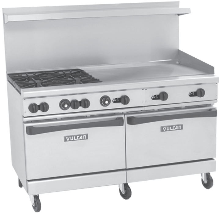
Model G60SS-4FT36 shown with optional casters