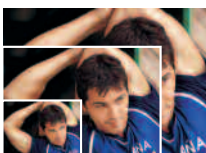
2.1 MP Up to 8" x 10" prints | 3.1 MP Up to 11" x 14" prints | 4.8 MP Up to 20" x 30" prints

With 5.0 MP, you can get a crisp, vibrant 20" x 30" print. The DX7590 supports a choice of full resolution or optimized 4" x 6" print with no image loss.