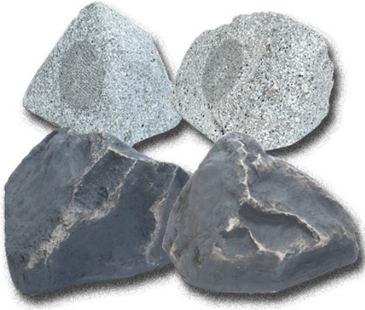
TFS5 rock speaker pair