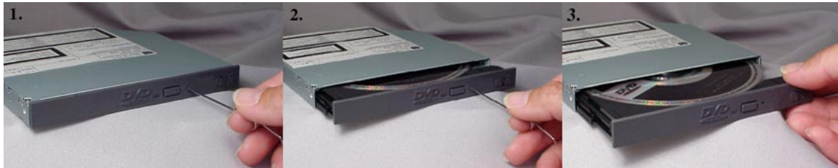
Figure 2.Using Emergency Eject