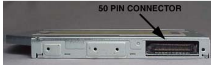
Figure 1. SD-C2732 DVD Writeable Drive Rear Panel – Connector

ATAPI Connector A 50-pin ATAPI interface connector is found at the rear of the SD-C2732 DVD-ROM drive. Connecting cable should use Japan Aviation Electronics Industry Limited KX14-50Series L or equivalent connector.