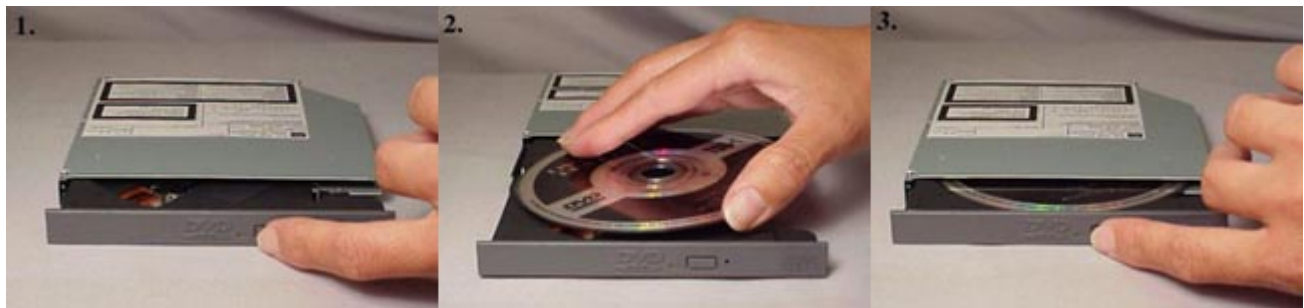
Figure 1. Inserting Disc

To insert a DVD in a DVD-ROM drive that is mounted horizontally, perform the following steps: