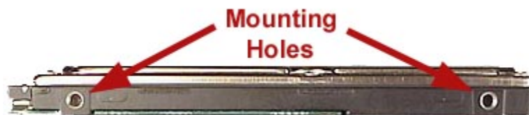
Figure 2.HDD Mounting Holes

Important Note: Disconnect power from your computer system before beginning installation.