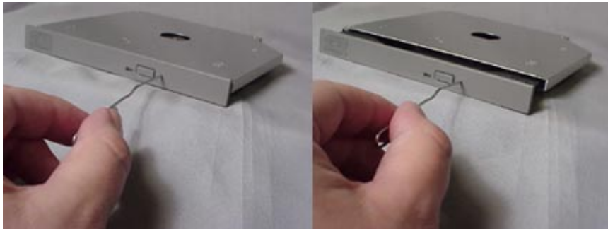
Figure 2.Using Emergency Eject