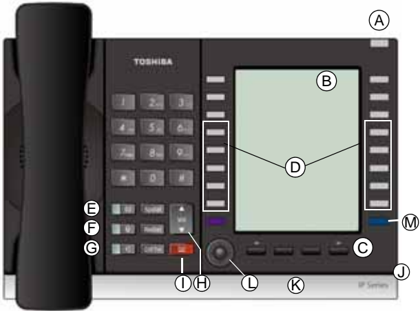
10 Programmable Feature Buttons 9-Line LCD