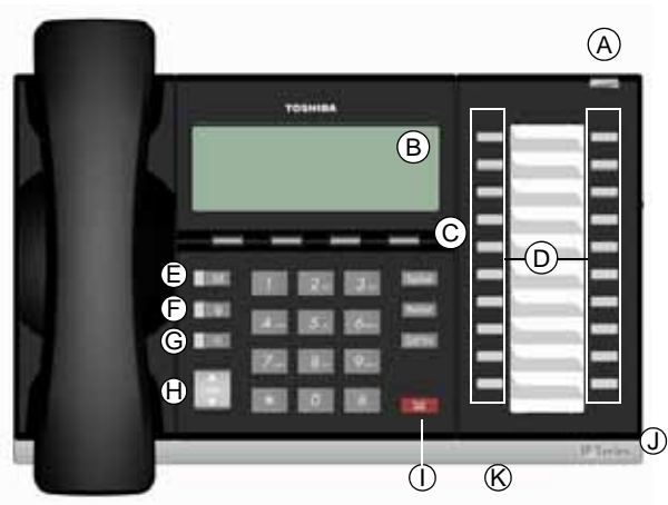
20 Programmable Feature Buttons 4-Line LCD