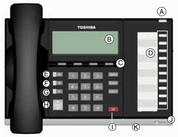
10 Programmable Feature Buttons 4-Line LCD