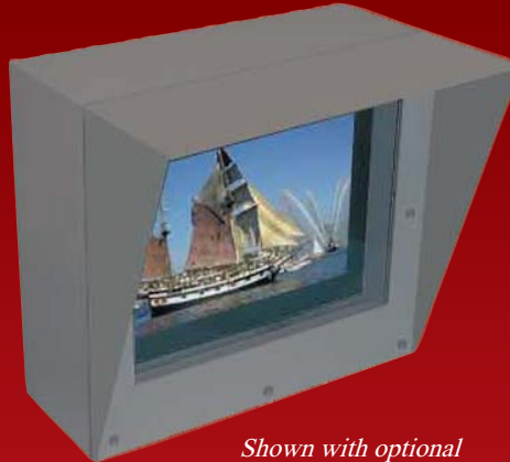
Shown with optional sun shield