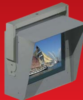
Shown with ceiling mount option # 2: yoke bracket

Download from www.Somanuals.com . All Manuals Search And Download.