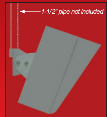
Shown with ceiling mount option # 1: pipe bracket