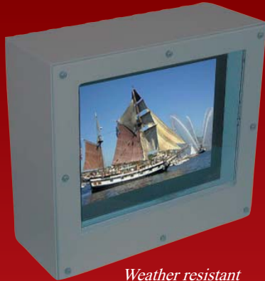
Weather resistant housing