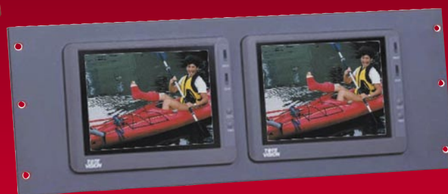
LCD-642D Dual 19" Rack Mount Unit