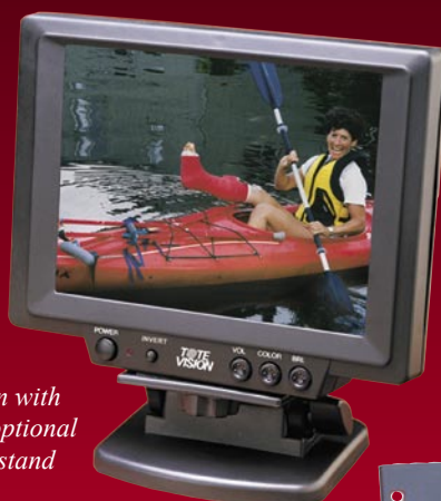
LCD-640 monitor with audio