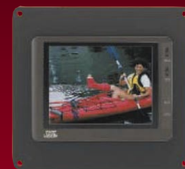
LCD-642 shown with Flush Mount Kit