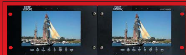
LCD-703HD2 Dual Rack Mount Unit