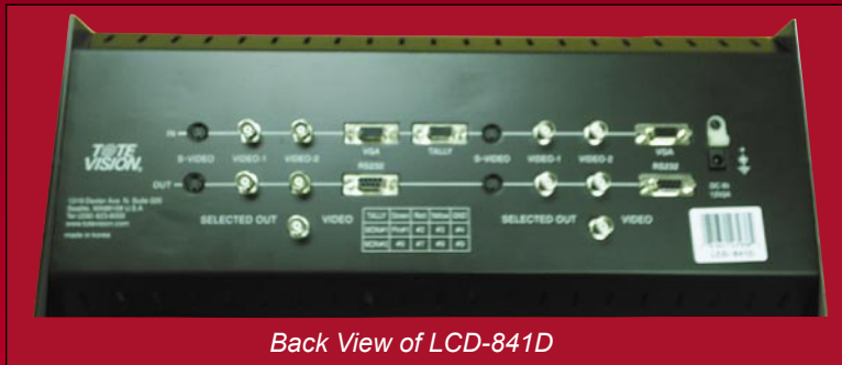
Back View of LCD-841D