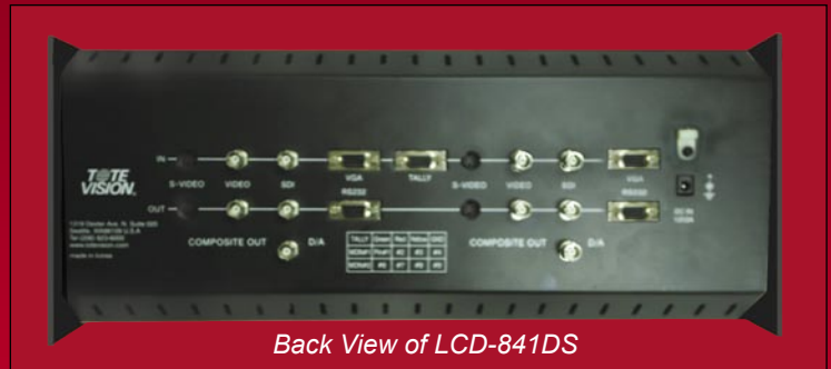
Back View of LCD-841DS