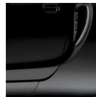
Black with Black or Red cloth or Tan leather interior

*See Specifications page for more information on Toyota's Supplemental Restraint System (SRS).