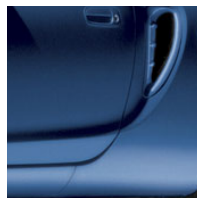
Spectra Blue Mica with Black cloth interior