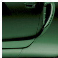
Electric Green Mica with Tan leather interior