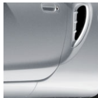
Liquid Silver Metallic with Black or Red cloth or Tan leather interior