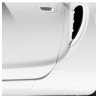
Super White with Black or Red cloth or Tan leather interior