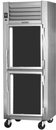
Model RHT126WPUT-HHG (shown with optional fluorescent lights & casters)