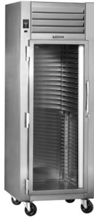
Model RHT132WUT-FHG (shown with optional interior arrangements & casters)