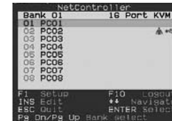
Main OSD Menu

To activate the OSD (On-Screen Display) Main Menu, use the hotkey sequence: ScrLk + ScrLk + Space Bar