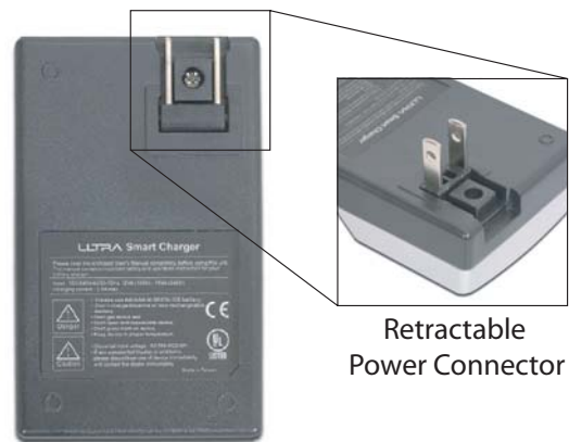
Retractable Power Connector