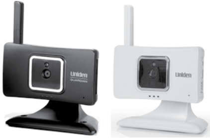
GC43 or GC43W (White) camera (1)