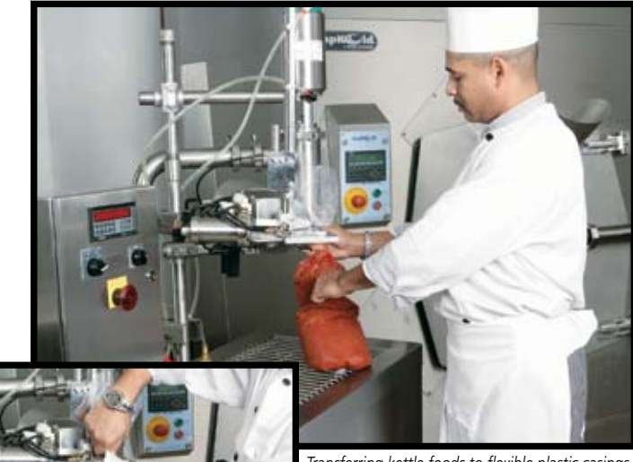
Transferring kettle foods to flexible plastic casings

At the completion of a cooking cycle, the Pump-fill Station draws product from the kettle, measures a pre-set volume, and fills a flexible plastic casing. The operator uses a station-mounted clipper to seal, attach a label, and trim the casing in one fluid motion. One employee can typically empty and package the entire contents of a 200-gallon (750-liter) kettle in 15-20 minutes. A Pump-fill Station can be shared by two or more kettles.