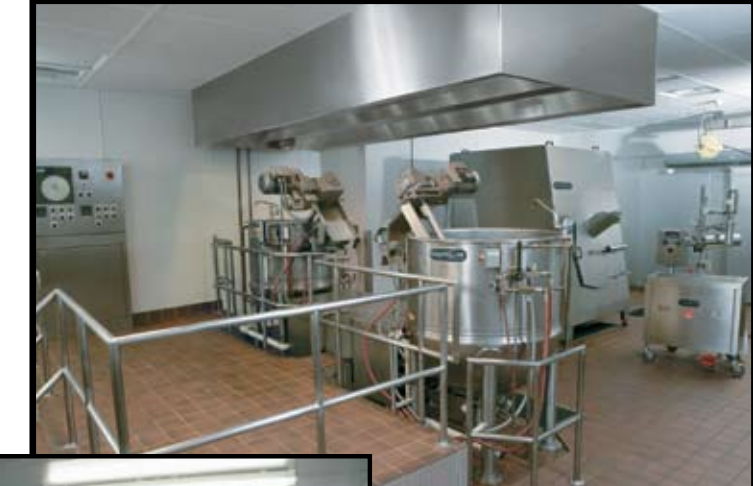
CapKold kitchen (from left to right, shown above) kettle control panel, (2) kettles, tumble chiller and pump-fill station

water bath chillers accelerate chilling and deliver safe, extended, refrigerated shelf lives up to 45 days.