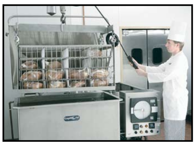
Loading and unloading food product with a push of a button

Water bath slow cooking can be done overnight, unattended. An integral control system monitors both cooking and chilling and provides a time/temperature production record for HACCP and quality assurance.