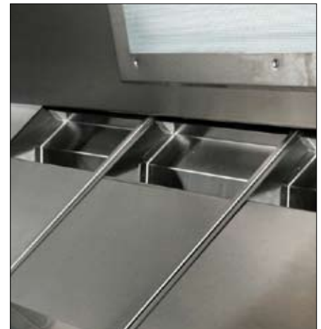
INSIDE FRONT OF HOOD: High velocity exhaust slot allows contaminated air to flow directly into the filter medium

Locating the high velocity exhaust slot as close to the top of the hood as possible allows the arched top to easily direct the contaminated heated air directly into the exhaust plenum. The slot is designed to create a rate of speed faster than the updraft velocities developing from the cooking process. This higher rate of speed, in conjunction with the arch, is the key to successfully capturing contaminated air at very low exhaust requirements.