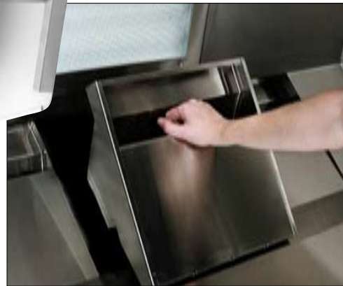
INSIDE FRONT OF HOOD: Easy and safe accessibility to filter medium

Now that's maximizing your energy and cost savings!