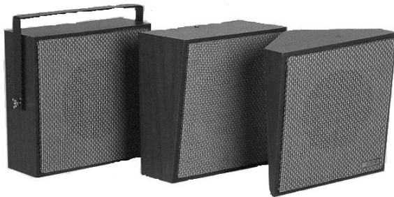
V-1062A, V-1064A, V-1066A