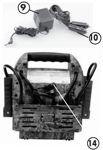
FIGURE 1B (REAR VIEW)