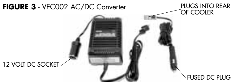
FIGURE 3 - VEC002 AC/DC Converter