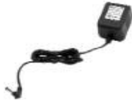
FIGURE 2 - AC CHARGER

WARNING: Use the supplied AC recharge adapter; do not substitute. AC recharging requires the use of the included AC charger/adapter that supplies 12 volts DC.