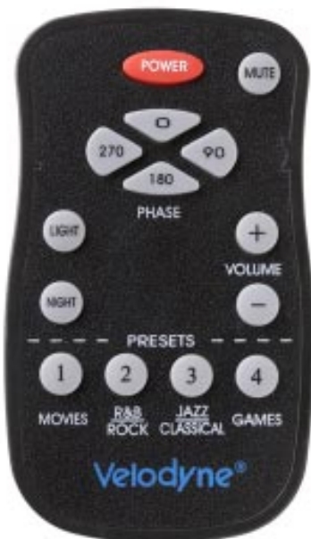
Figure 2. Remote Display

Figure 2 shows the remote control, enabling you to easily choose whatever listening mode you desire.