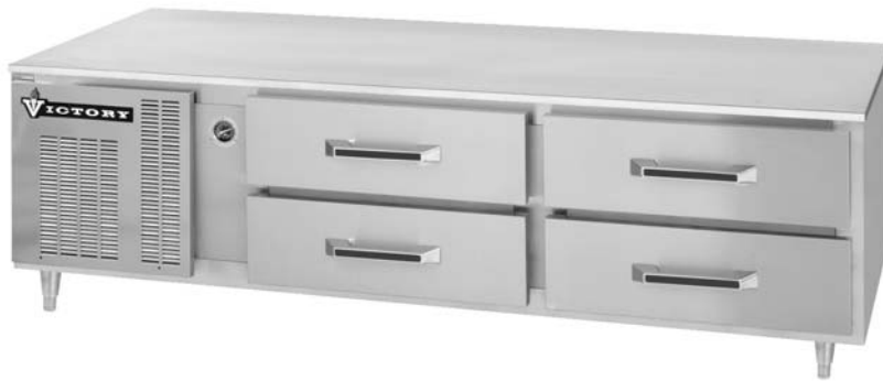
GRS-2-S7 Stainless Steel Tops are Optional