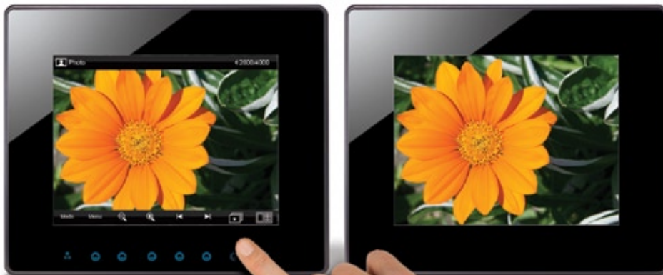
Photo mode touch controls activated.

> Hidden control buttons illuminate in blue when touched to indicate your selection and direct you to your photo, slideshow, music or video.