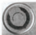
Combined or Vent Plugs