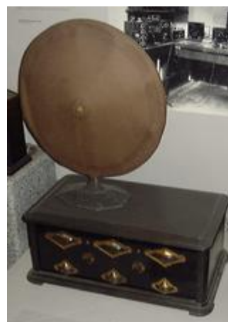
1925 Grebe radio receiver and 1924 Western Electric 540 speaker