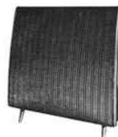
Walker's ESL, from Quad