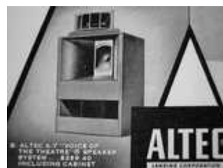
Aztec A-7 Voice of the Theatre, from Audio , Dec. 1961