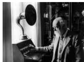
Oliver Lodge