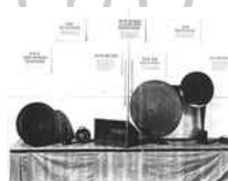
early Bell loudspeakers